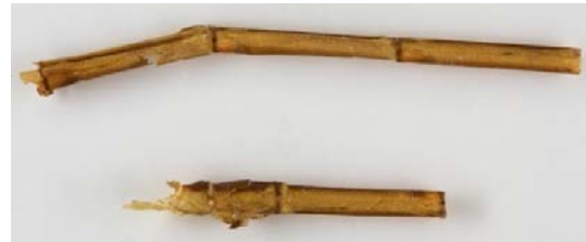
Fig. 3. Agriocnemis exilis , abdomen (partim) of specimen ZFMK ODO 2008/5.