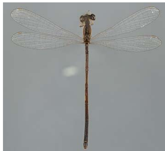
Fig. 4. Agriocnemis exilis , female, collected aboard ship, ca. 100 nm off West Africa in November 1893.

Movements of the desert locust Schistocerca gregaria (Forskål, 1775), which occasionally plagues Cape Verde, are monitored by the Food and Agriculture Organization of the United Nations (cf. FAO 2014). Locust movements from continental West Africa (Mauritania, Western Sahara, Senegal) to the Cape Verde Islands, as well as between islands within the archipelago, are facilitated by favorable winds that could also carry accidental odonate visitors. Possibly, the movements of S. gregaria can be used to better understand the origin and pathway of odonates that have only occasionally been reported from Cape Verde.