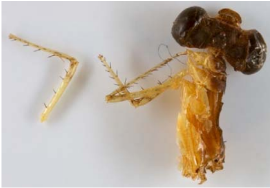
Fig. 1. Agriocnemis exilis , head, thorax and legs (partim) of ZFMK ODO 2008/5.

BOA VISTA: (4b) 1 adult male [ZFMK cat. no. ODO 2008/5], H. Lindberg coll., K.F. Buchholz det. First record for the Cape Verde archipelago (Fig. 1-3).