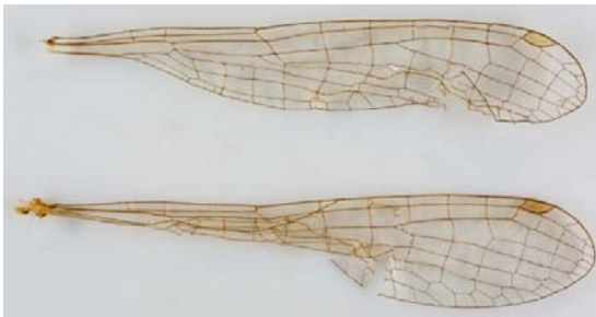
Fig. 2. Agriocnemis exilis , wings of specimen ZFMK ODO 2008/5.