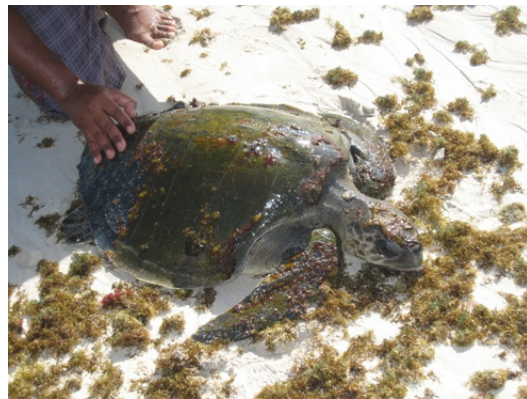
Fig. 1. Olive ridley Lepidochelys olivacea , found at Atalanta beach, Boavista, 4 November 2004 (Nuria Varo-Cruz). Fig. 2. Olive ridley, Baía Grande, Boavista, 26 January 2010 (Jon Crighton).