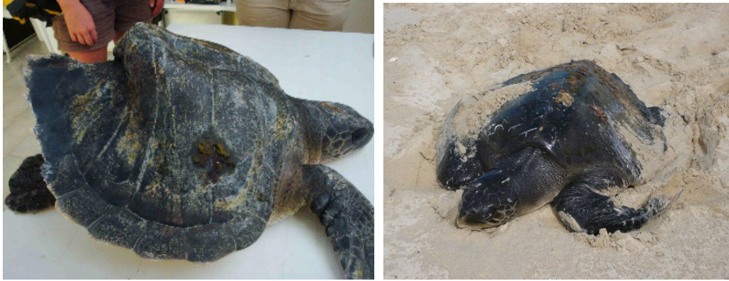
Fig. 3. Olive ridley Lepidochelys olivacea with deformed carapace, captured off Santa Maria, Sal, 27 November 2010. Fig. 4. Olive ridley, Atalanta beach, Boavista, 28 March 2011.

Table 1 summarizes information of records of olive ridley sea turtles in the Cape Verde Islands. Information obtained from photos and measurements taken of some individuals show that records no. 1 and 7 were the smallest turtles recorded, their size being indicative of juveniles (cf. Fretey 2001). These two records are of