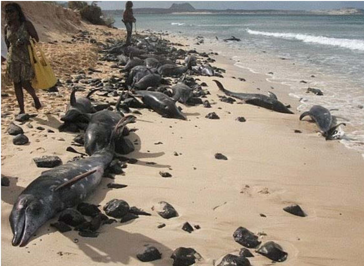
Fig. 7. Rough-toothed dolphins Steno bredanensis , Praia de Estoril, Boavista, 20 October 2010.

Rough-toothed dolphin is distributed in deep tropical and subtropical oceanic waters worldwide (Miyazaki & Perrin 1994) and is probably found throughout the tropical and subtropical East Atlantic (cf. Jefferson et al. 1997, de Boer 2010a, b, Weir 2010a).