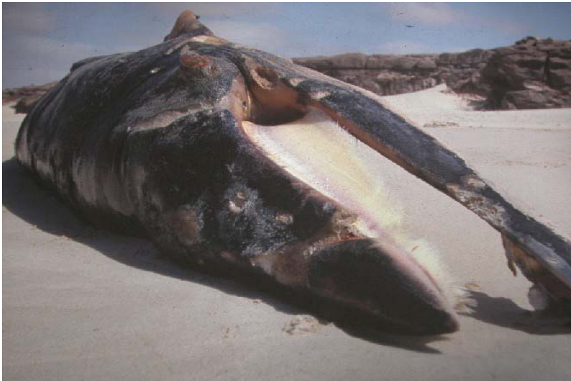
Fig. 2. Common minke whale Balaenoptera acutorostrata , Praia de Boa Esperança, Boavista, 10 May 2000 (Nuria Varo).

Common minke whale occurs in the Atlantic and Pacific Oceans, as well as at tropical latitudes in the southern hemisphere (Rice 1998). In West Africa, there are sightings off Western Sahara, strandings from Mauritania and Senegal, possible sightings off The Gambia (Van Waerebeek et al. 1999) and a bycatch landing from Guinea (Bamy et al. 2010). The collision of a minke whale with a ship's propeller off Boavista is only the second documented case of a whale struck by a vessel in West Africa, after a Sei whale was brought into the port of Dakar, Senegal, on the bow bulb of a container ship (Félix & Van Waerebeek 2005).