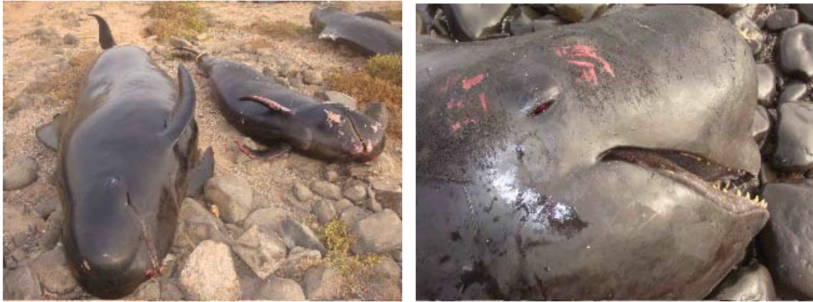
Fig. 18-19. Short-finned pilot whales Globicephala macrorhynchus , Praia de Monte Leão, Sal, 19 June 2010.

Mass strandings of Short-finned pilot whale have been a long known phenomenon in the islands and in the past the meat of these whales was readily flensed and often preserved for later consumption (cf. Hazevoet & Wenzel 2000). Today, on Boavista, teeth of stranded pilot whales are often extracted for use in the production of tourist souvenirs. The animals on Santiago and Sal in June 2010 were removed and buried within a day by the local authorities, thus preventing any proper investigation of the events. Short-finned pilot whale is one of the commoner cetaceans occurring in the Cape Verde region (Hazevoet & Wenzel 2000) and apart from the strandings listed here, many live sightings were reported during the last 10 years.