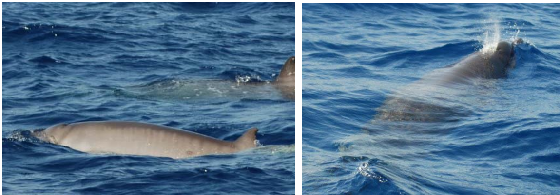
Fig. 5-6. Beaked whales Mesoplodon cf. europaeus, off southern Sal, 11 February 2010.