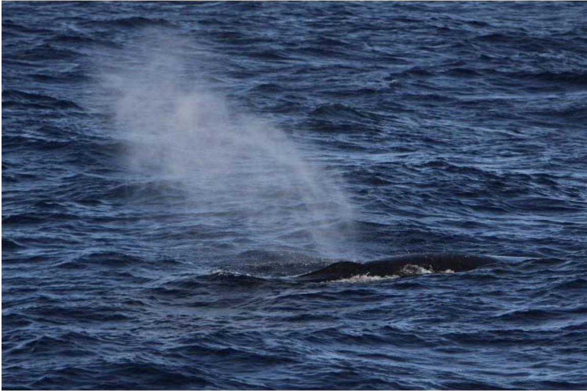
Fig. 3. Bryde's whale Balaenoptera brydei , 20°55'N, 22°25'W, 20 October 2009 (Mike Greenfelder).