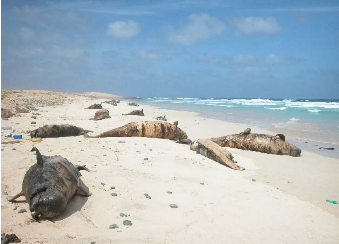
Fig. 16. Short-finned pilot whales Globicephala macrorhynchus , Praia de Abrolhal, Boavista, 8 November 2009 (Pedro López).