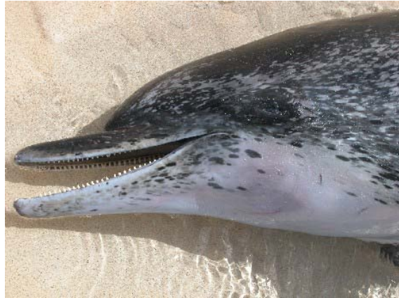
Fig. 9-10. Atlantic spotted dolphin Stenella frontalis , immature and adult, Praia da Chave, Boavista, 29 April 2006 (Pedro López).