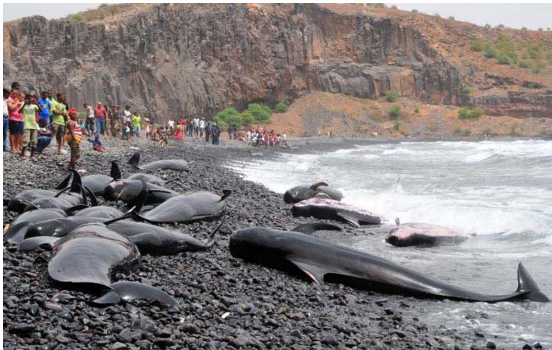
Fig. 17. Short-finned pilot whales Globicephala macrorhynchus , Praia do Coqueiro, Santa Cruz, Santiago, 19 June 2010.