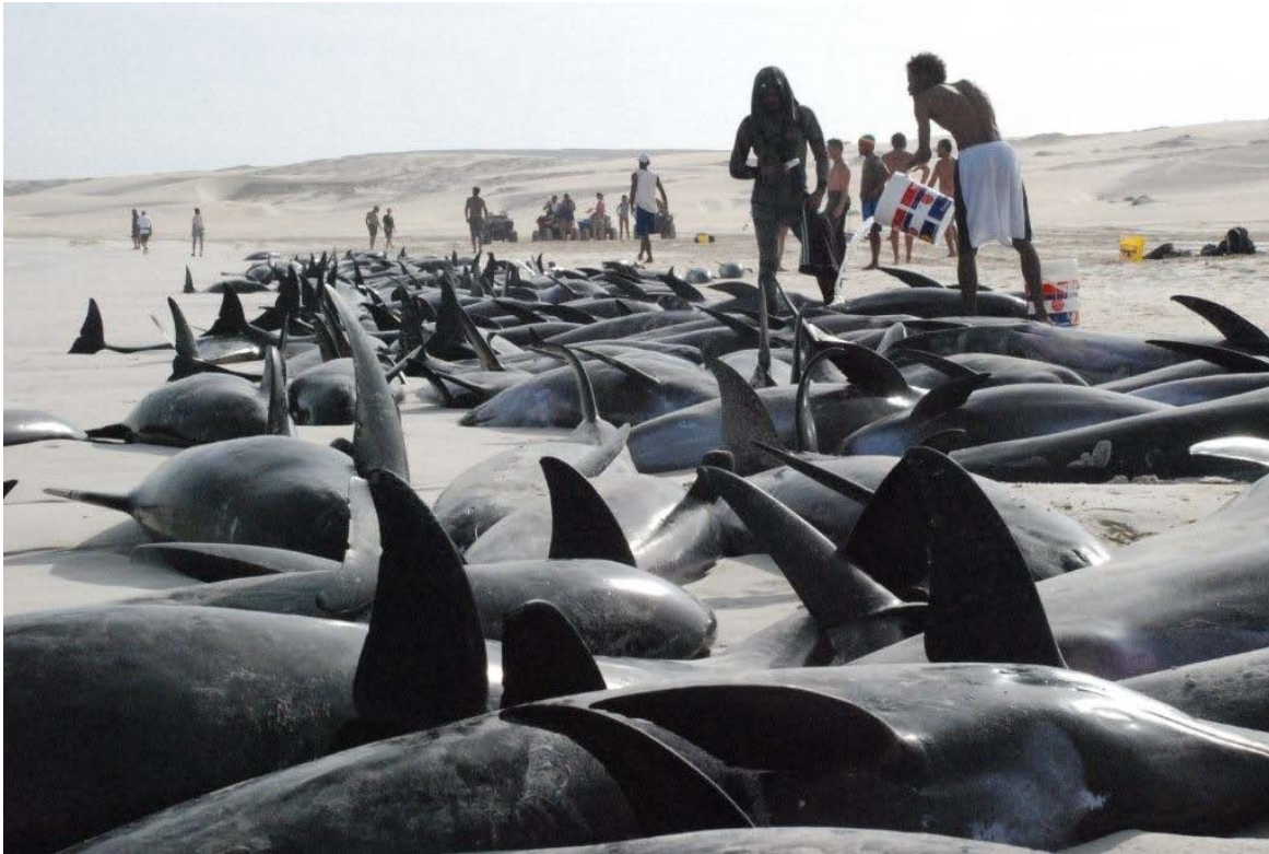
Fig. 11. Melon-headed whales Peponocephala electra , Praia da Chave, Boavista, 18 November 2007.