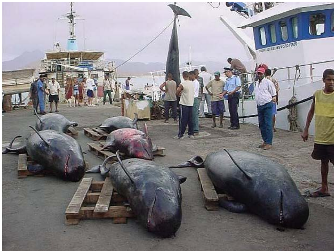
Fig. 15. Short-finned pilot whales Globicephala macrorhynchus , Mindelo, São Vicente, 6 August 2002; stranded at Praia de Escurrelete, Santo Antão, 5 August 2002 (Carlos Pulú).