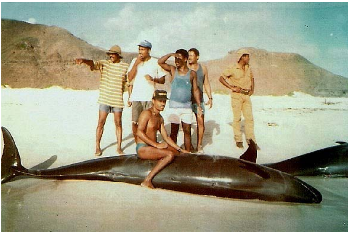
Fig. 12. False killer whale Pseudorca crassidens , Praia do Canto, Boavista, ca. 1990.

not be determined anymore, but this was either during the late 1980s or early 1990s. Apparently, all animals died on the beach. A single animal of unknown sex, ca. 2.5-3 m in length, was found at Praia de João Barrosa,