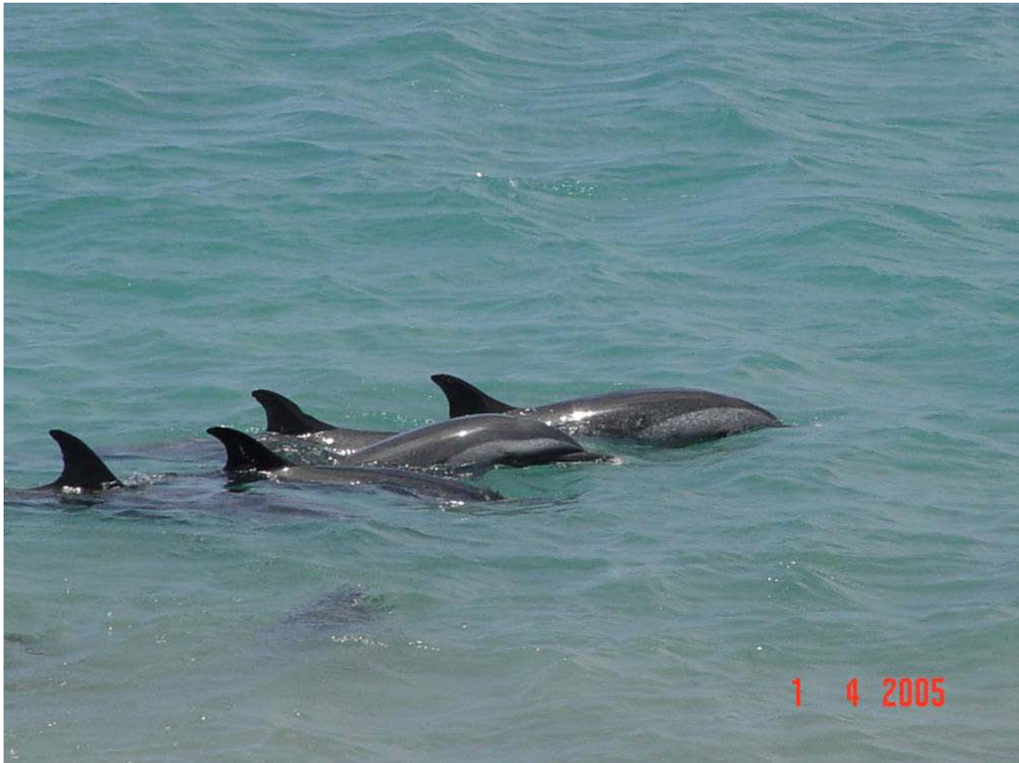
Fig. 8. Pantropical spotted dolphins Stenella attenuata , Praia de Laginha, Mindelo, São Vicente, 1 April 2005.

between ca. 40°N and ca. 40°S (Perrin 2001). It is likely to be widely distributed off West Africa. However, because at sea identification of spotted dolphins can be difficult for inexperienced observers, the possibility of confusion with S. frontalis exists. Moreover, as the taxonomy of these dolphins was only sorted out by Perrin et al. (1987), it is often unclear to which taxon records previous to that date should refer. Distribution off West Africa is poorly understood and was summarized by Jefferson et al. (1997) and Weir (2010a). The latter specified a number of cases in which attenuata had been wrongly identified as frontalis and vice versa . For detailed information on the identification of Pantropical spotted dolphin, see Perrin (2001).