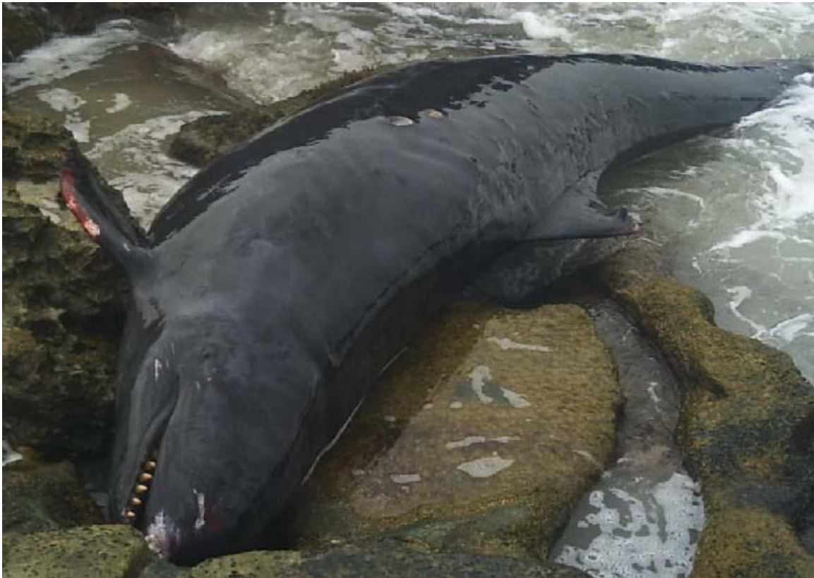
Fig. 13. False killer whale Pseudorca crassidens, Praia de João Barroso, Boavista, 22 July 2007.