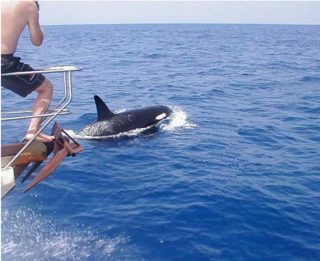
Fig. 14. Killer whale Orcinus orca , off western Boavista, 21 September 2001 (Wolfgang Ensbacher).

single sighting record of Killer whale for the Cape Verde Islands, i.e. a pod of nine animals south of Sal, 29 February 1996. Killer whales are distributed throughout the world's oceans, although they are more common at high latitudes (Dahlheim & Heyning 1999). Records from West Africa were summarized by Jefferson et al. (1997); see also Hammond & Lockyer (1988), Van Waerebeek et al. (2009), Weir (2010a) and Weir et al. (2010).